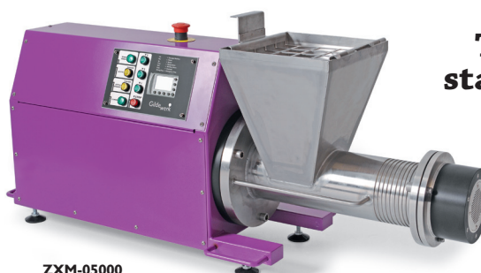
ZXM-05000 1500 Watt extruder

You're probably already familiar with our purple soap machine, the ZXM-05000 extruder. This is a superb, powerful soap machine with a 1500 Watt output. It is placed inside a sturdy housing, equipped with PLC control (a small computer) and has a bronze worm screw. This PLC control manages the machine for you: all aspects can be preset. It indicates the correct working temperature and performs self-diagnostics to inform you whether or not everything is working smoothly. However, not everyone needs this kind of technology. This is why we're adding two diligent workhorses to our range. They are the ZXM-07000, a 1500 Watt extruder, and the ZXM-07050, a 2200 Watt extruder. We've limited the electronics in both machines to a minimum and left off the attractive finishes on the housing. What remains are two tough and robust workers which ooze power. Of course, we haven't compromised safety and the worm screw is still made of bronze.